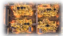
Chemical and pharma